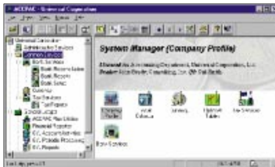
Common Services is the heart of your accounting system, simplifying system administration