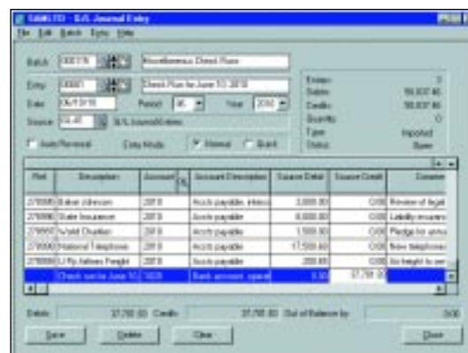
Fast and easy data entry makes managing your General Ledger easy and intuitive